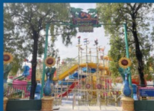
Jungle Sunami (Rainy Jungle)