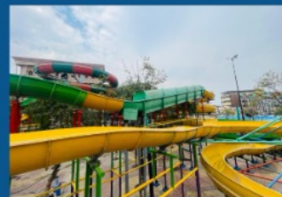
Tango - Tango-Charlie - Charlie (Water Slide)