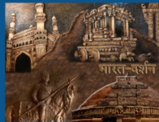
Bharat Darshan (Ek Jhalak Atulya Bharat Ki)