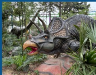
Dino Safari (Woh aaj bhi Zinda hain)